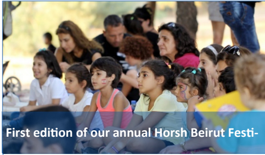
First edition of our annual Horsh Beirut Festi-