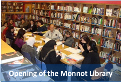
Opening of the Monnot Library