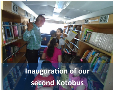
Inauguration of our second Kotobus