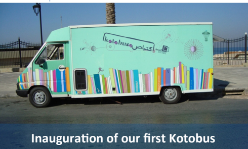
Inauguration of our first Kotobus

Start of our continuous Youth Debate Program