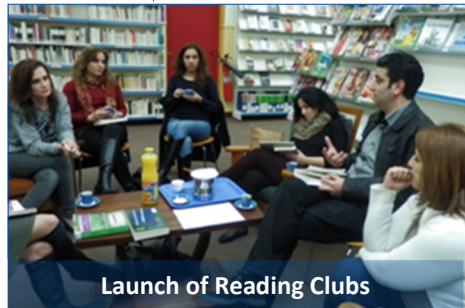
Launch of Reading Clubs